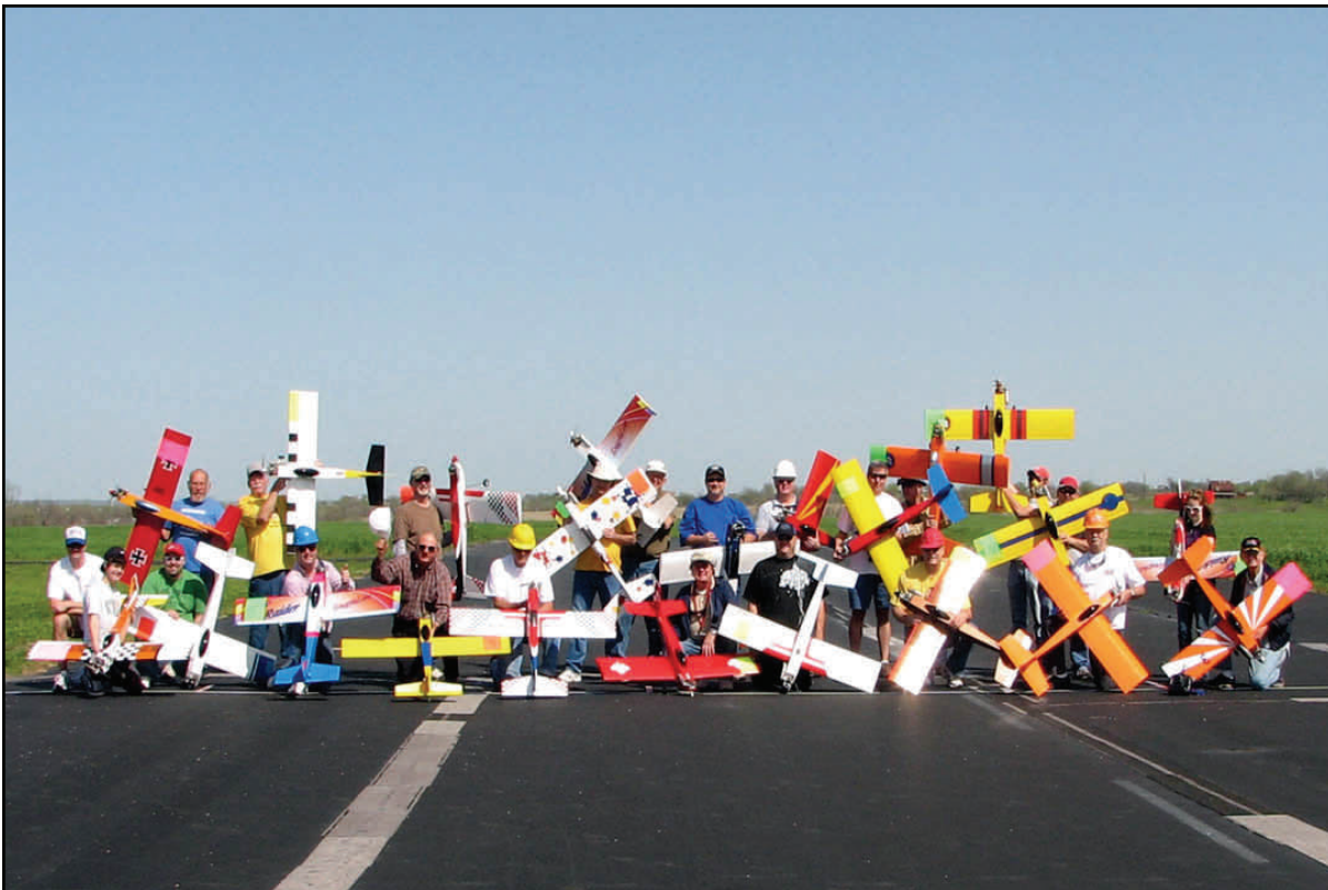
Club 40 Competitors