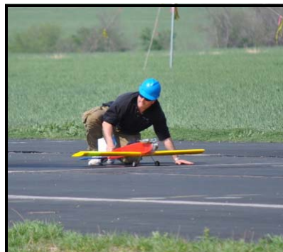
Time for the SUPER PUSH!