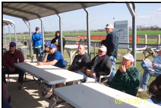
Class Time! Everybody pay attention, and NO SLEEPING!

Thanks to every one for collaborating to make this a good event!