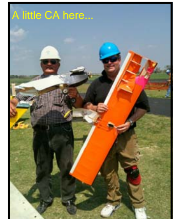
A little CA here...