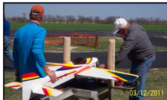
A flying we will go, a flying we will go...