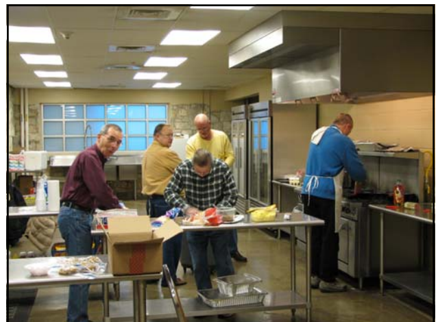
Cooking, cooking, cooking, keep those burgers cooking!