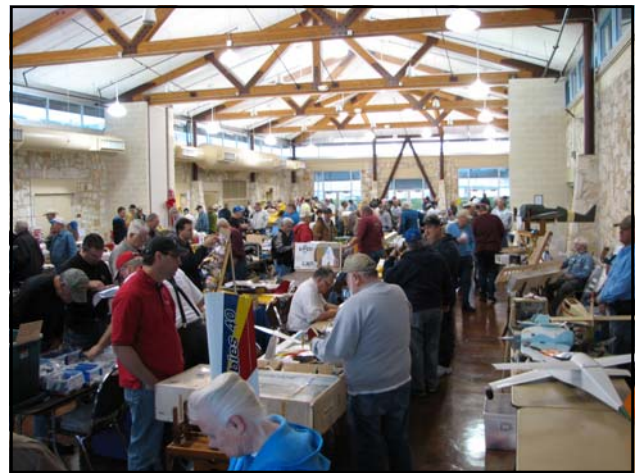
We are busy, busy, busy!