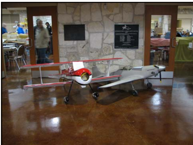
Not exactly a couple of parkflyers...