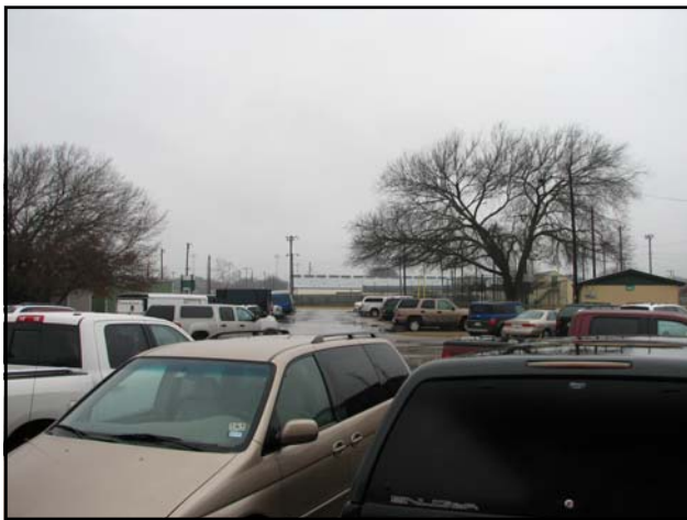
The sun must be out there somewhere!

See everyone next year, January 21st, and 22nd, 2012!