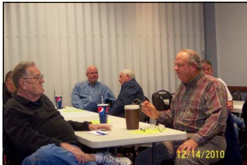
Time to get your Auction Face on!