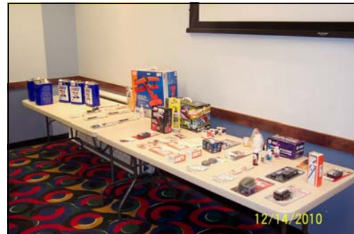
The table of hobby - n - goodstuffness