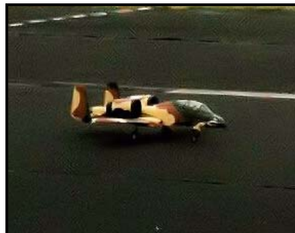
On the runway, ready for action!