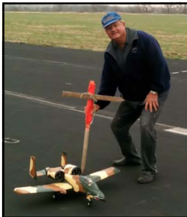
Is "Father" Large giving out divine assistance or a dire prediction?