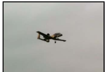
It really does fly! But will it land?