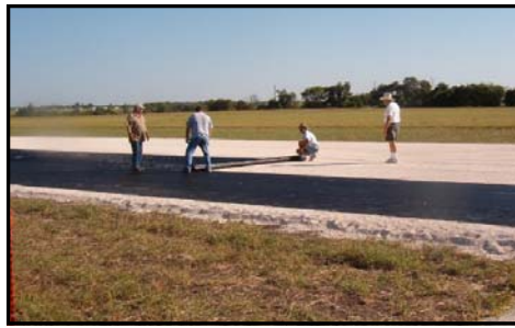
A rolling we will go! (and how many yards to we have to do?)