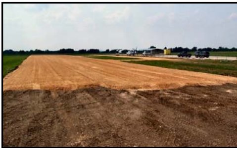
That is a bunch of sand! (ok, who took my Tonka Truck?)