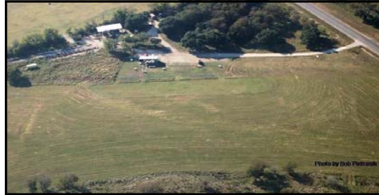
It looks so small, that runway was only 400ft long!