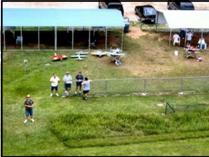
Yep, real green grass!