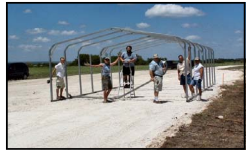
Yea! We have a shelter! (Umm, where is the roof?)