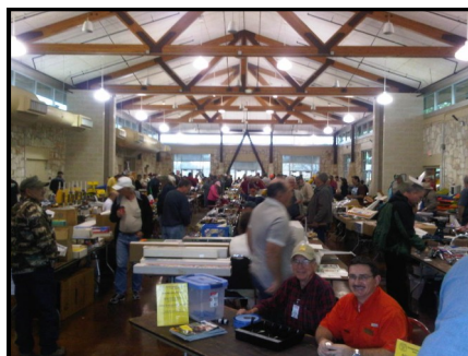
Busy place! We are Full!